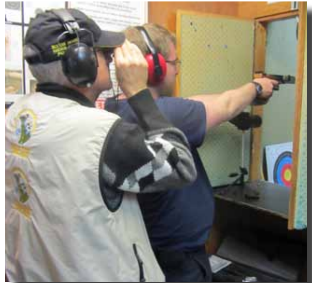
BPSA hosted annual Twin County Bounty Hunters Cowboy Action Shooting.